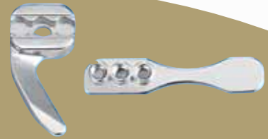
Functional Mandibular Advancer