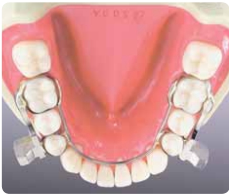
FMA on bands in the mandible

Sections of the FMA can be fitted to the vestibular aspects of thermoformed splints to act as retentive units or anti-snoring devices.