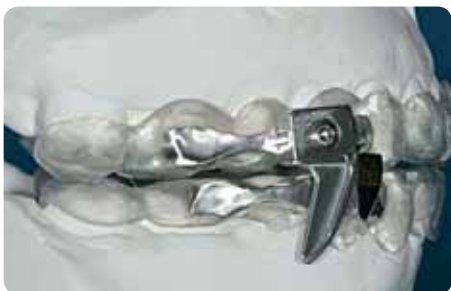
FMA fixed to thermoformed splints

Sections of the FMA can be fitted to the vestibular aspects of thermoformed splints to act as retentive units or anti-snoring devices.