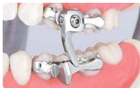
FMA welded to bands

In comparison to traditional removable functional orthodontic appliances the FMA is fixed, therefore its efficiency is completely independent from patient compliance.