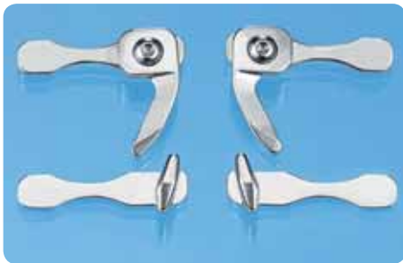
Pre-assembled parts for laboratory fabrication of the FMA appliance

The Functional Mandibular Advancer (FMA) is a new-type fixed appliance, developed for the correction of Class II discrepancies, which is non-dependent on patient compliance. The essential elements of this Herbst-alternative comprise protrusive bars and inclined planes fixed to cast splints or prefabricated bands on the vestibular surfaces of the posterior teeth in the gingivobuccal fold.