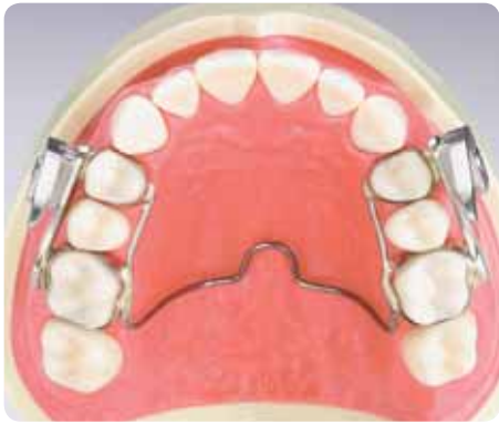
FMA on bands in the maxilla

As the individual components are standardised, manufacturing and laboratory fabrication of the appliance are not only straightforward, but can also be customised according to the diagnosis. This provides for fixation to cobalt chrome splints or crowns as well as prefabricated bands. The length of the protrusive bars can be adjusted in the laboratory depending on the specific case (dimensions of the gingivobuccal fold, opening angle of the mouth). Detailed laboratory instructions are enclosed.