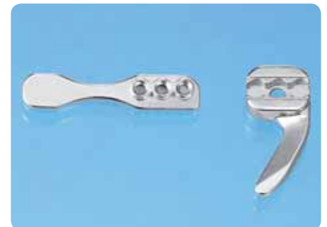
Egg timer-shaped mounting plates with threaded inserts and protrusive bar with receptacles for three different positions

Reactivation along the sagittal plane can be carried out by relocating the protrusive bars into threaded inserts positioned further toward the anterior. Thus, step-by-step adjustment allows for gradual habitation, in particular with adult patients.